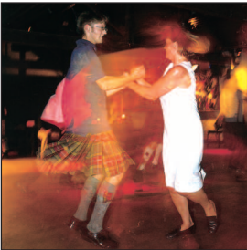
Scottish Country Dancing

on Saturday – a Grand Banquet and entertainment