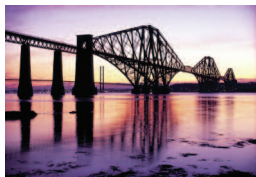
The Forth Bridge

Accommodation at the Pollock Halls of Residence outside the conference dates can be arranged by direct application to 'Edinburgh First' +44 (0)131 6512007 e-mail: bed.breakfast@ed.ac.uk